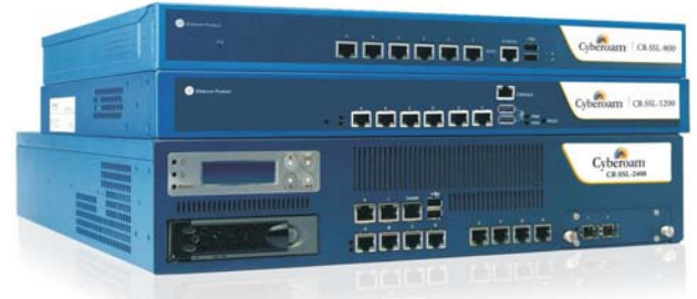
CR SSL Series : CR-SSL-800, CR-SSL-1200, CR-SSL-2400

Cyberoam SSL VPN is an easy-to-use, simple application access and security solution for enabling high-trust, secure remote access to Enterprise applications and resources. Enterprises use Cyberoam SSL VPN to collaborate securely with employees, customers and partners. Cyberoam SSL VPN comes with unique network obfuscation feature that hides the internal network details from intentional or unintentional exploitation by a user or hacker.